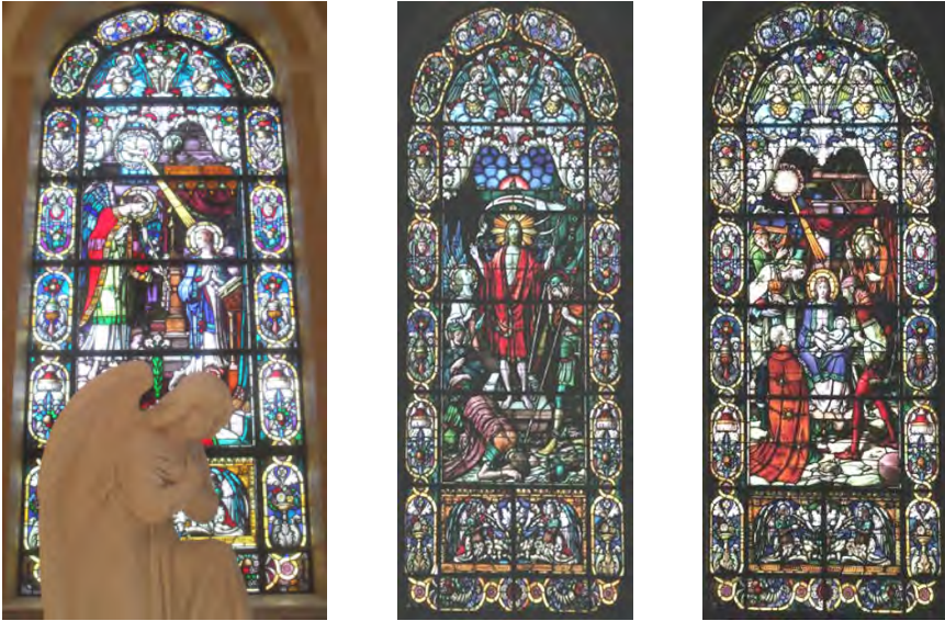
Three large stained glass windows from MBS now surround the sanctuary at St. Bede Church - (from left) The Annunciation, The Resurrection and the Nativity.